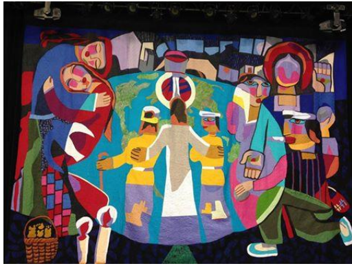
Notes and ideas from our 2015 Sierra Pacific Synod Convention