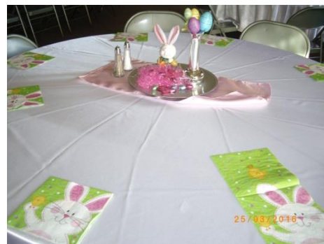
There is always room at the table!