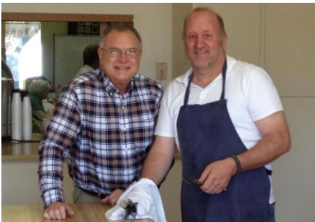
The chief cooks and bottle washers rock!!!!