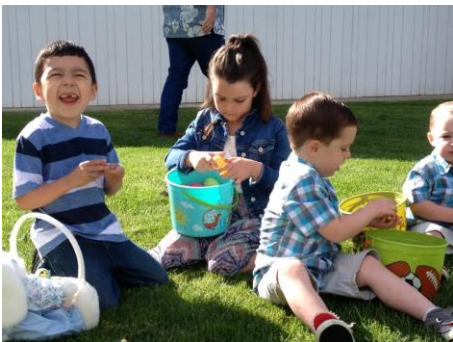
Easter Joy and filled baskets delight.