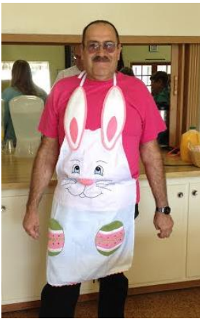
The Bear Bunny was here!!!