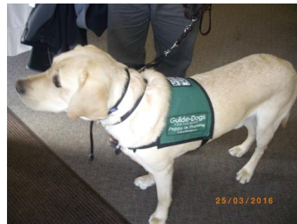
One of our guests In training to guide—