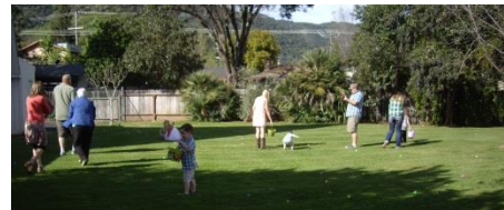
Lookin for those elusive eggs